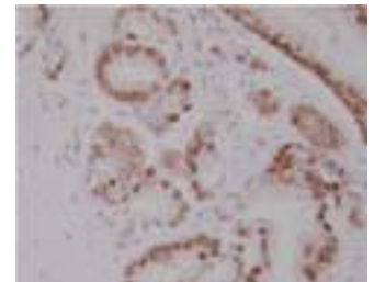
Human Prostate gland paraffin section

Storage Store at 2 - 8 °C up to one month. For long-term storage, the solution may be frozen in working aliquots. Repeated freezing and thawing is not recommended. Storage in a frost-free freezer is not recommended.