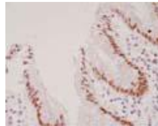
Human Large intestine paraffin section