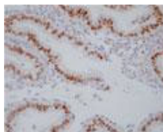
Human Uterus Endometrial epithelium cell paraffin section