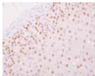
Rat Adrenal gland paraffin section