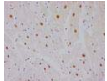
Human Heart Myocardium paraffin section

Storage Store at 2 - 8 °C up to one month. For long-term storage, the solution may be frozen in working aliquots. Repeated freezing and thawing is not recommended. Storage in a frost-free freezer is not recommended.