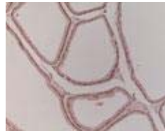
Rat Prostate gland paraffin section